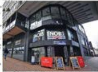
At the new Sheds premises in Southside Selly Oak

"There's a healthy nightlife in Westside, but also all the extra facilities and amenities of the city, with many top bars and the new entertainment district."