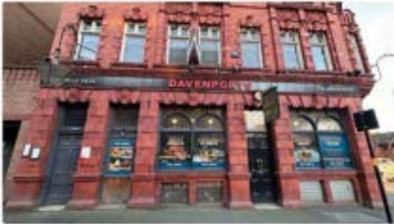
The Bulls Head

A pub in Birmingham city centre once used by the BBC as 'The Garrison Tavern' in Peaky Blinders is set to reopen as an Indian restaurant.