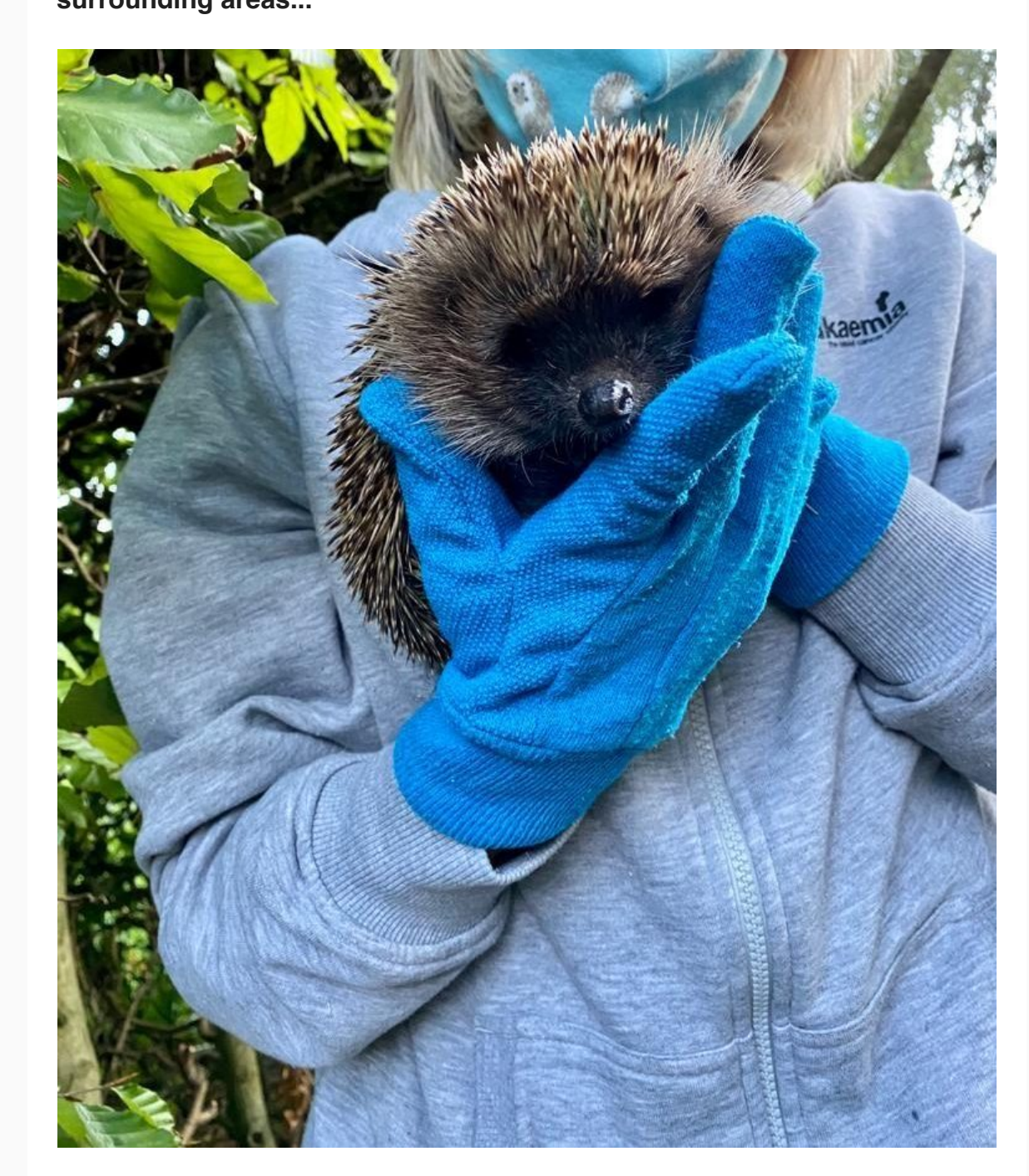
It's 'hooray' from city hedgehogs for Westside bank worker's rescue work

Hello and welcome to your weekly Westside World news digest. Each Friday, Westside BID brings you the top stories from in and around Broad Street, Brindleyplace, Five Ways, Centenary Square, Broadway Plaza and