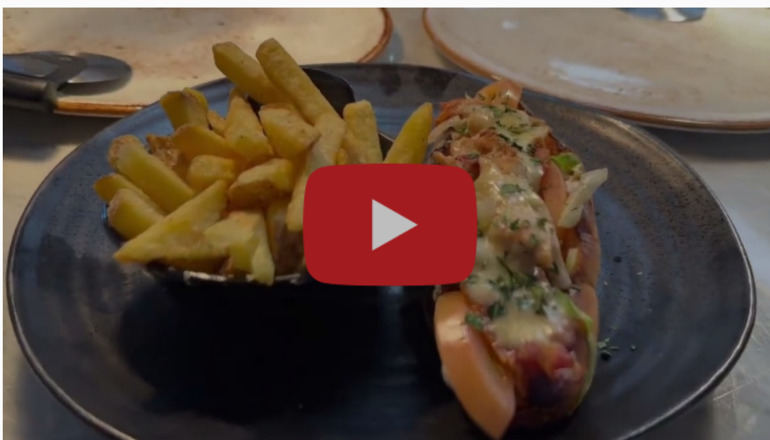
The treats in store for football fans on Westside