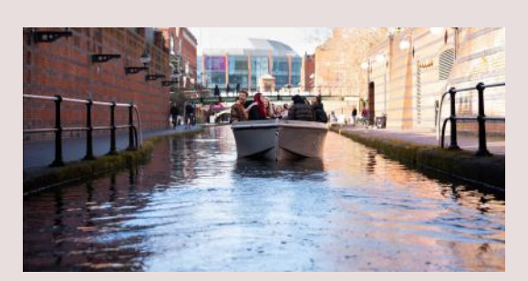
Work in Westside.

If you're struggling to fill a vacancy, please get in touch with Luisa Huggins at